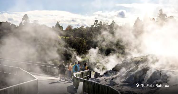
📍 Te Puia, Rotorua