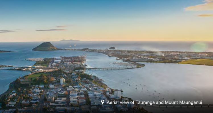
📍 Aerial view of Tauranga and Mount Maunganui