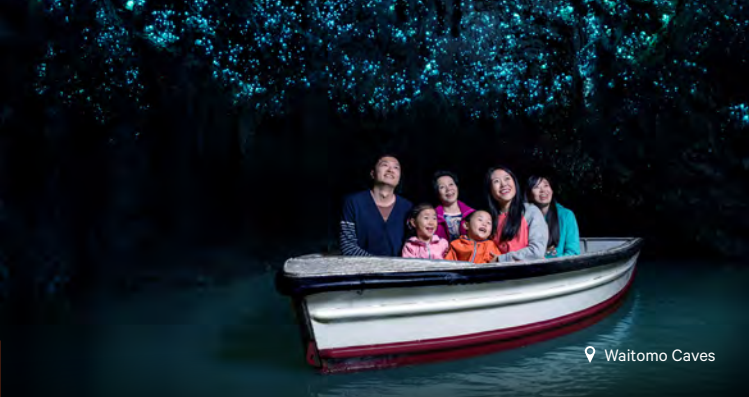
📍 Waitomo Caves