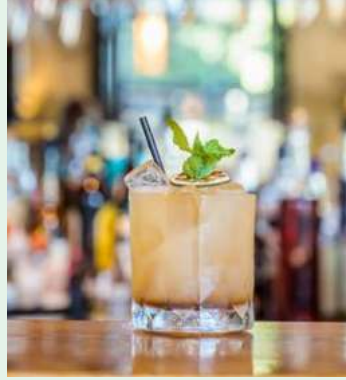
Centrale at Clarence