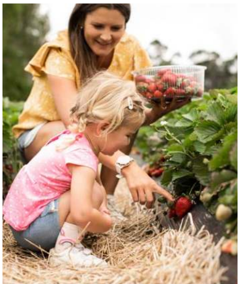
Strawberry picking at Julians Berry Farm