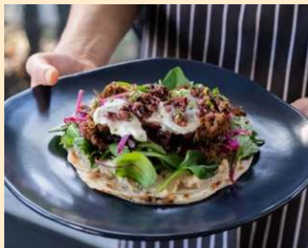
Clarke Road Kitchen