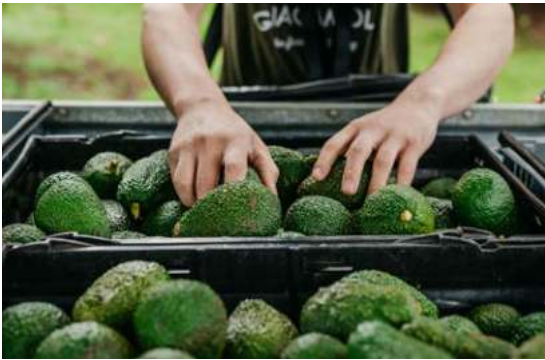
The Avo Tree avocados