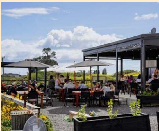
The Cider Factorie