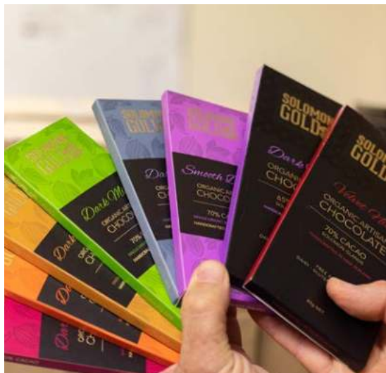
Solomons Gold Chocolate