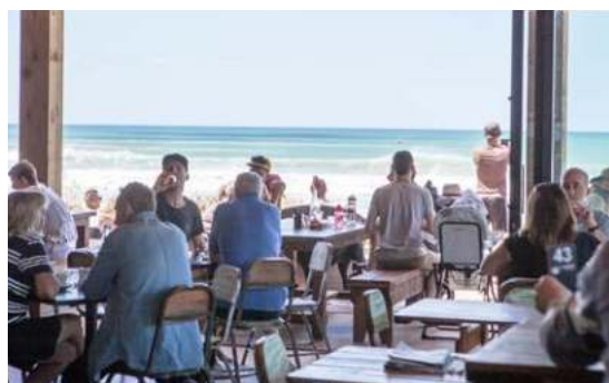
Gibbo's Fresh Fish (above) & Flatwhite Waihi Beach