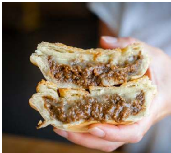
Award-winning pies at Patrick's Gold Star Pies

Heilala Vanilla ; This local company supports vanilla growers in the Kingdom of Tonga, taking their pure farmed vanilla beans and turning them into a range of premium products that are acclaimed by professional chefs for their rich flavour.