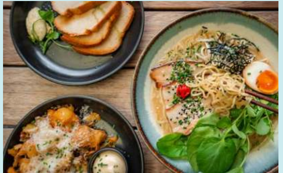
Izakai Bar and Eatery

Special mention must be made of the Mount's very own Special Mention café. This hidden gem can be hard to spot on Oceanbeach Road but serves up the most Instagram-worthy dishes that taste as great as they look. Eddies & Elspeth is a collaborative venture between a brunch parlour and bakery – and both are equally delicious. Enjoy perfectly poached eggs at Eddies or grab the flakiest croissant or pastry out of the cabinet at Elspeth's right next door. Roxie's Red Hot Cantina is a pumping taco joint that serves up the best street food from L.A. to the Baja Coast. Portions are definitely as big as the flavours and their frozen margaritas are epic. Master Kong also packs a punch with its seriously