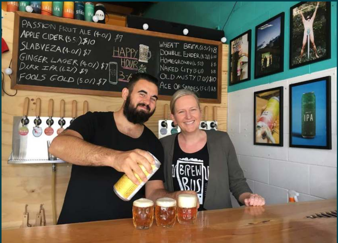
Craft beer tours with Brewbus

Tio Ōhiwa (formerly Ōhiwa Oyster Farm) have recently started a guided tour where you can cruise along the Ōhiwa Harbour, discover the local culture and heritage, experience a working oyster farm and dig into a kaimoana feast.