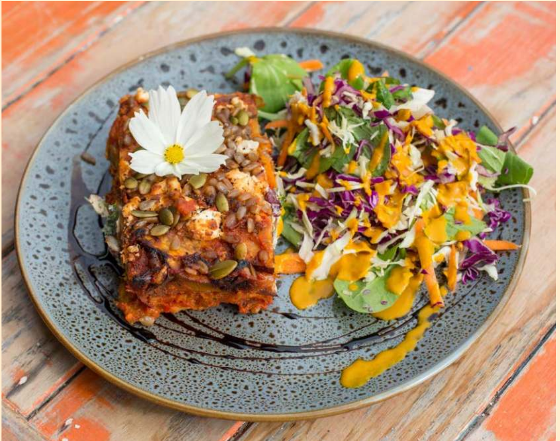
The Daily Café

Experience the irresistible allure of The Daily Café in Te Puke, where divine coffee and delectable cuisine await, all while supporting the local community. Around the corner is The Packhouse - Lumberjack Taproom , a collaboration between Lumberjack Brewing and the Okere Falls Store, offering an exquisite range of tap beers and mouthwatering food. Also in Te Puke is El Cartel , the go-to spot for authentic Mexican food. The birria tacos are to die for, along with their generous sized burritos, tacos, nachos, you name it! Indulge in the authentic Italian flavours of The Trading Post - Osteria Italiana in Paengaroa, where heavenly pastries and an all-day menu beckon.