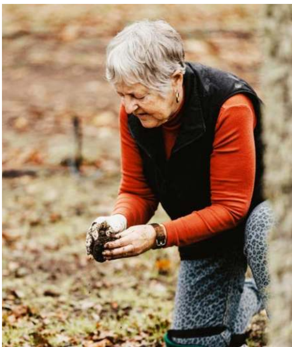
Black Périgord truffle harvest at Te Puke Truffles

R n' Bees in Whakatāne is also a popular stop for locals and visitors to pick their own berries throughout the summer months.