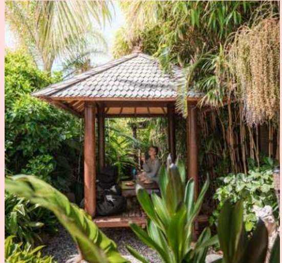
The Secret Garden

The historic Talisman Hotel is one of the oldest venues in the Bay. This garden bar and bistro is a great place to enjoy a sunny afternoon or evening meal, with fresh herbs and avocados sourced straight from their courtyard. The sophisticated menu makes the most of seasonal and locally-sourced ingredients and has something to please everyone. If you need a morning pick-me-up while in Katikati, you'll find Common Ground café tucked away behind the local library. Their freshly-made pastries, scones, muffins and slices are to die for, and they serve hearty salads and lunch fare too. If you're lucky enough to spot a custard square in their cabinet, grab one quick! The Orchard House believes fresh is best, so a lot of the fruit and vegetables used in their café is grown on site. They use free-range meat, and their menu features a wide range of vegetarian, vegan and dairy-free options. Everything is sourced as close to home as possible, and even their sauces and relishes are made from scratch so you can enjoy a quality meal in this charming spot on the outskirts of Katikati.