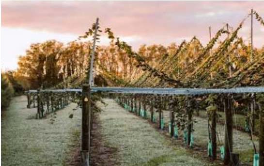
Morning at the kiwifruit orchards