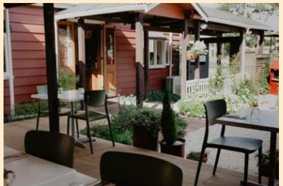
The Trading Post - Osteria Italiana

Experience the irresistible allure of The Daily Café in Te Puke, where divine coffee and delectable cuisine await, all while supporting the local community. Around the corner is The Packhouse - Lumberjack Taproom , a collaboration between Lumberjack Brewing and the Okere Falls Store, offering an exquisite range of tap beers and mouthwatering food. Also in Te Puke is El Cartel , the go-to spot for authentic Mexican food. The birria tacos are to die for, along with their generous sized burritos, tacos, nachos, you name it! Indulge in the authentic Italian flavours of The Trading Post - Osteria Italiana in Paengaroa, where heavenly pastries and an all-day menu beckon.