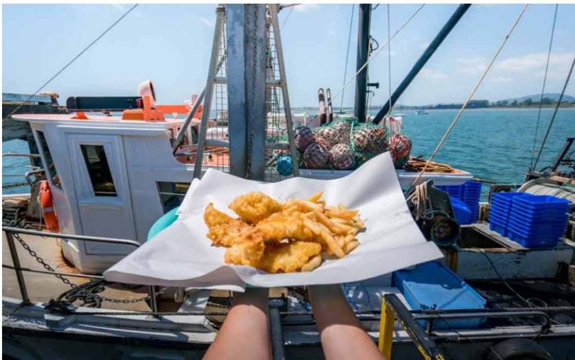
Fish & Chips at Bobby's Fresh Fish Market