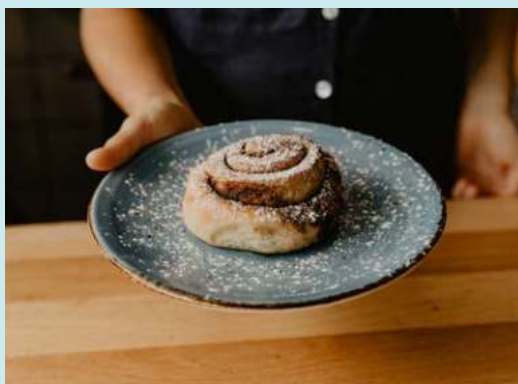
Tay Street Store

Mount Made is famous for their small batch ice cream and inventive flavours such as black hokey pokey ice cream. The flavours are hand-crafted using local ingredients such as Solomons Gold chocolate, Bionic Coffee and Somerfields strawberries. Sea People Ice Cream is another local favourite. They specialise in plant-based (non-dairy) treats using a unique blend of cashew nuts and coconut milk. Their menu includes berries and cream, espresso brownie, and pecan caramel, and their gluten-free waffle cones are baked and rolled daily on site. Finally, Wildflour bakery epitomises everything we love about food in the Bay – unique goods made with love, precision and plenty of flair! Their range of gooey raw slices, bliss balls and freshly baked cinnamon brioche buns are to die for.