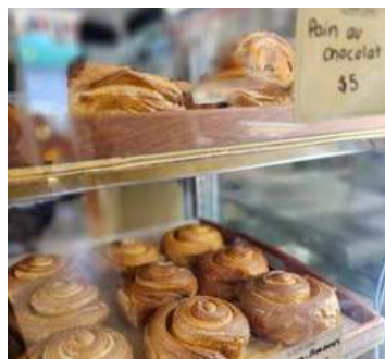
Cigol (left) and L'Épicerie Larder (below)