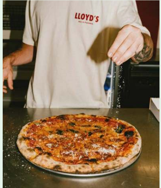
Lloyd's Deli & Pizzeria

Nectar on The Strand brings a touch of Saigon to Tauranga, serving up epic Vietnamese flavours in a casual yet fabulous setting. Their cocktails are superb and the menu is substantial. Umami in Pyes Pa also boasts a trendy fit-out. Their modern fusion menu combines flavours of southeast Asian cuisine with a Pacific twist and all meals are beautifully plated and presented. Miss Gee's Bar & Eatery serves specialty cocktails and no less than 30 different types of gin! Delicious casual dining is also on offer, which you can enjoy in their sunny courtyard and 'greenhouse' space. If you're a sweet tooth, look no further than But First Dessert . Choose from their mouth-watering cabinet selection or order one of the fabulous creations from their menu. The General at the Lakes (formerly known as Maude) is a great breakfast, lunch or casual dinner spot. Serving top-notch coffee and quality food, you'll be very happy to have dined here. Centrale at Clarence is a lively Italian cocktail bar located inside one of the historic treasures in Tauranga, the former