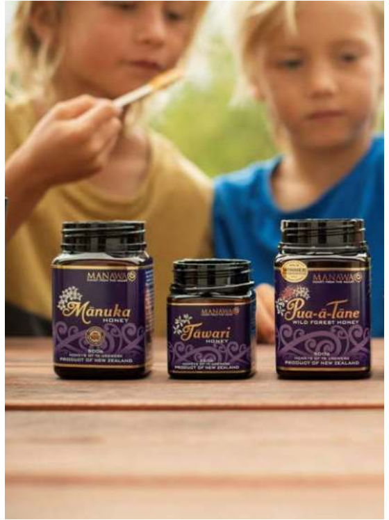
Liquid gold at Manawa Honey

You don't have to look very far in the Bay to spot the horticultural crops which power the local economy and boost our general health. Kiwifruit vines and avocado trees dominate the landscape in both Te Puke and Katikati, where the vast majority of these multi-billion dollar crops are grown in New Zealand each year. In fact, there are more than 10,000ha of kiwifruit in the Bay of Plenty alone! Our climate and soil conditions are perfect for these fruit and, as a result, they taste sensational. Keep an eye out for roadside stalls as you'll often find bags for sale direct from the grower. Award-winning olive groves are also found here, producing high-quality olive oil and other olive products. Meanwhile, Harbourside Macadamias near Katikati is making a big name for itself. This orchard produces a unique range of sweet and spicy macadamia products, as well as an oil and a premium macadamia liqueur to pour over ice-cream or to include in cocktails. Delicious!