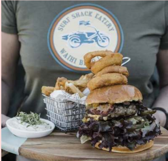
Best Burgers at the Surf Shack