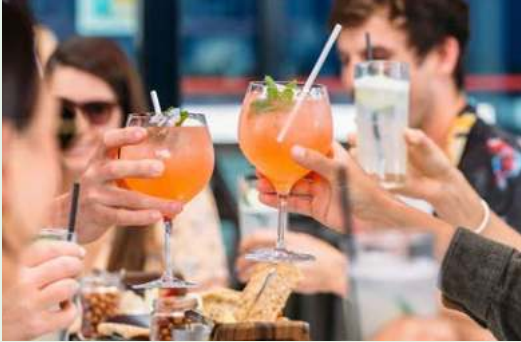
Miss Gee's Bar & Eatery